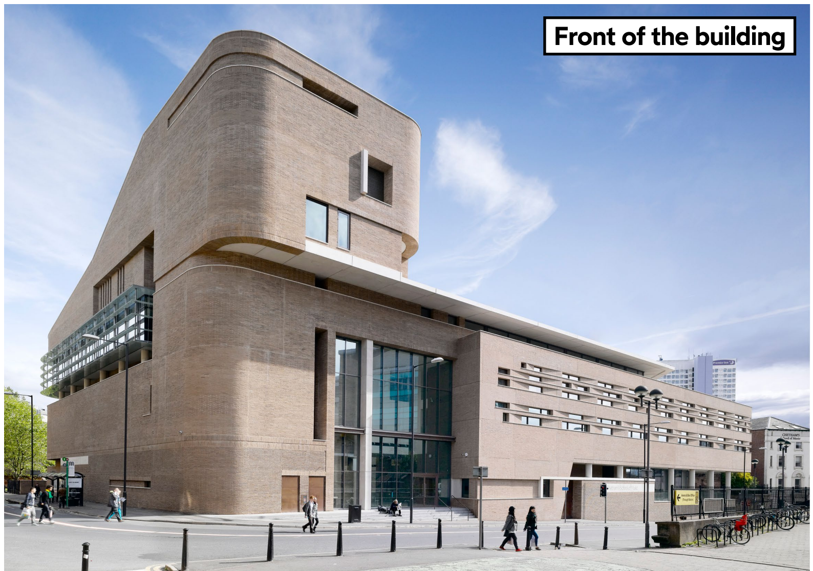
Front of the building