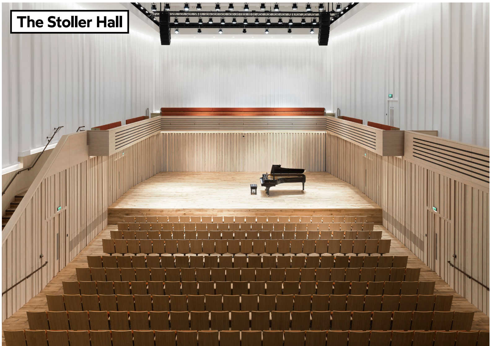
The Stoller Hall